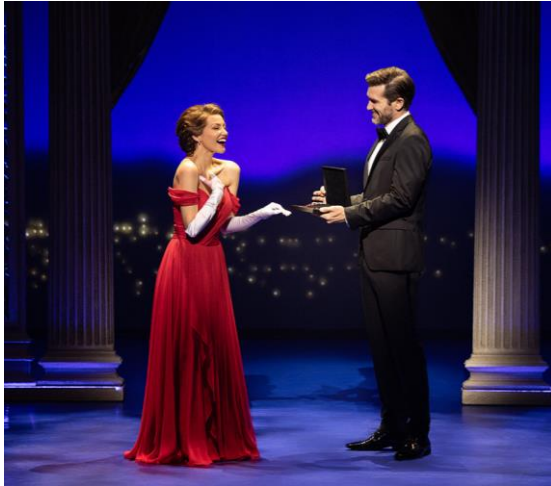
Pretty Woman: The Musical (includes lunch out before activity)

Experience the big romance, dazzling energy and all the feel-good charm of the beloved film. With irresistible songs, sparkling humour and a love story that sweeps you right off your feet, it's a vibrant, heart lifting night at the theatre that leaves you smiling long after the final bow.